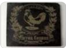
Stone / marble