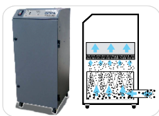
Fume Extraction System (With Filters)