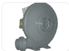
Fume Extraction System (Without Filters)